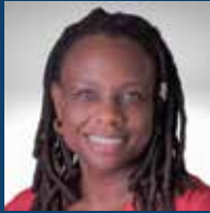
Mali Locke Inherent Group