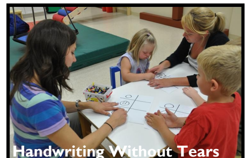
Handwriting Without Tears