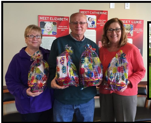
Knights of Columbus Joliet Council #382 donates Easter baskets to our center.