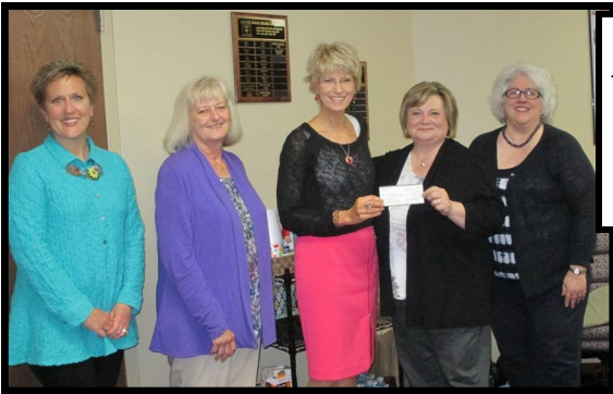
Holly Club presents a check for $5,000 to Caregivers' Support Groups for individuals with dementia/Alzheimer's and other chronic health conditions such as brain injuries.