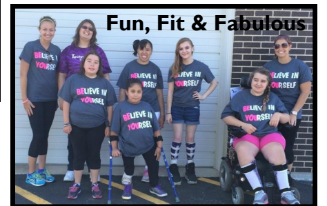
Fun, Fit & Fabulous