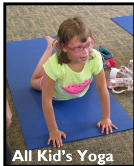
All Kid's Yoga