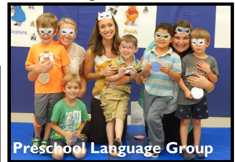
Preschool Language Group