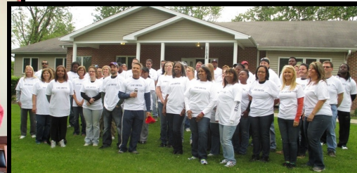
ComEd/Exelon employees volunteer their time painting an Easter Seals residential home in Joliet. Over 70 volunteers were present!