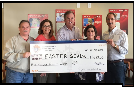
St. Jude of Joliet Knights of Columbus #10637 present a check to Easter Seals Joliet Region for $693!