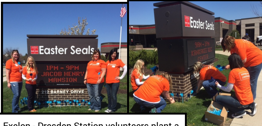
Exelon - Dresden Station volunteers plant a pinwheel in honor of Child Abuse Prevent Month.