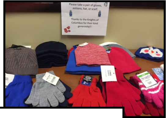
Knights of Columbus Council #382 donated hats and gloves to our clients.