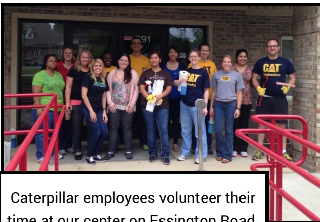
Caterpillar employees volunteer their time at our center on Essington Road.