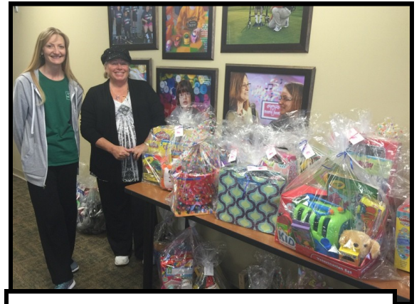
Easter baskets were donated by the Every Girl Deserves to Fly Foundation.