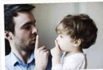
14 Months: Index finger point, Shhh gesture