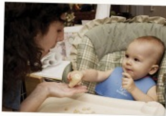
9 Months: Give, Shake head