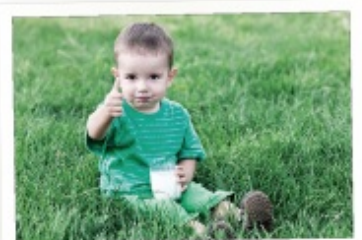
15 Months: Head nod, Thumbs up, Hand up