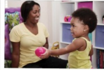
11 Months: Show, Wave