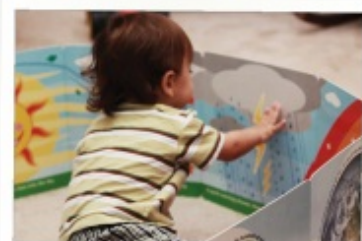
12 Months: Open hand, Point, Tap