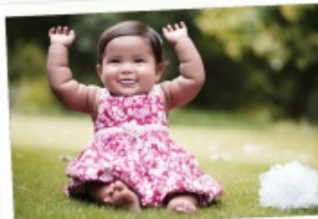
10 Months: Reach, Raise arms