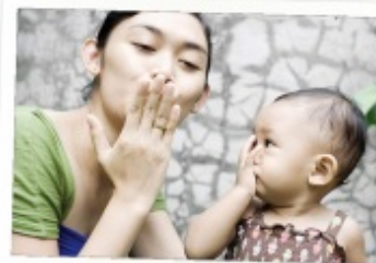
13 Months: Clap, Blow a kiss