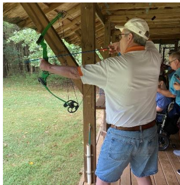
The chance to hit the bullseye makes archery a daily activity no matter what the weather.