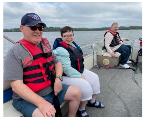
Pontoon boat rides to enjoy the scenery and water with friends is a favorite for all.

Learn more at https://www.easterseals.com/tennessee/our-programs/camping-recreation/ . Sessions fill quickly so register as soon as possible.