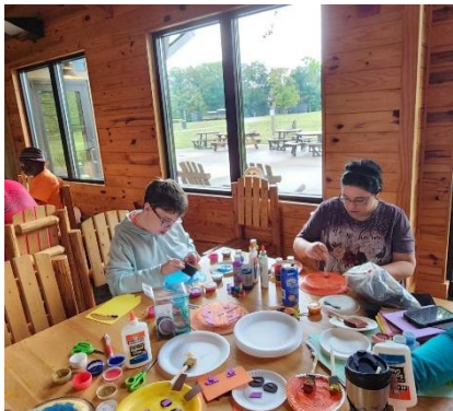
Creating masterpieces through artwork is very popular with many adult campers.